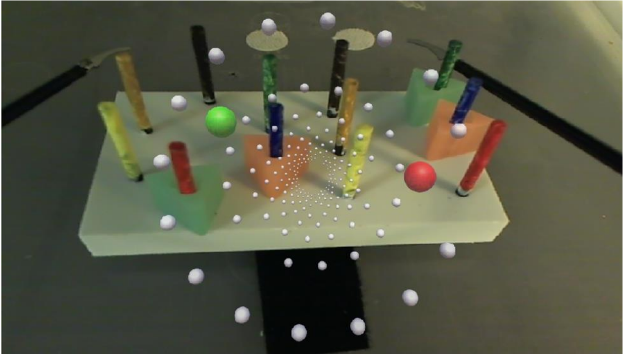
Figure 4. Dual task condition with ball-and-tunnel task projected over peg transfer task

Auditory task. Like the original ball-and-tunnel task, participants must respond when the auditory signals changes location. In the auditory version, the signal is played from a different speaker. The present configuration consists of two speakers positioned at 3 o'clock and 9 o'clock analogous to the balls in their neutral positions at the beginning of the ball-and-tunnel task. The other four speakers are placed at the 1 o'clock, 5 o'clock, 7 o'clock, and 11 o'clock positions. To improve discriminability there is a 45-semitone difference between the sounds presented on the right side versus the left.