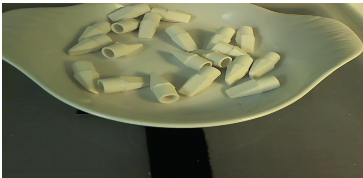
Figure 3. An image of the eraser and bowl task

Eraser and bowl task. For the low workload, primary task participants must grasp 12 large, white pencil erasers one at a time and place them in a bowl using one Johnson & Johnson Ethicon dissector/grasper, then remove them (see Figure 3). This process will be repeated as many times as possible within five minutes. Timing for this task begins when the first eraser is successfully grasped. Participants will use only their dominant hand to complete this task. Should a participant unintentionally drop an eraser or miss the bowl it will be counted as an error.