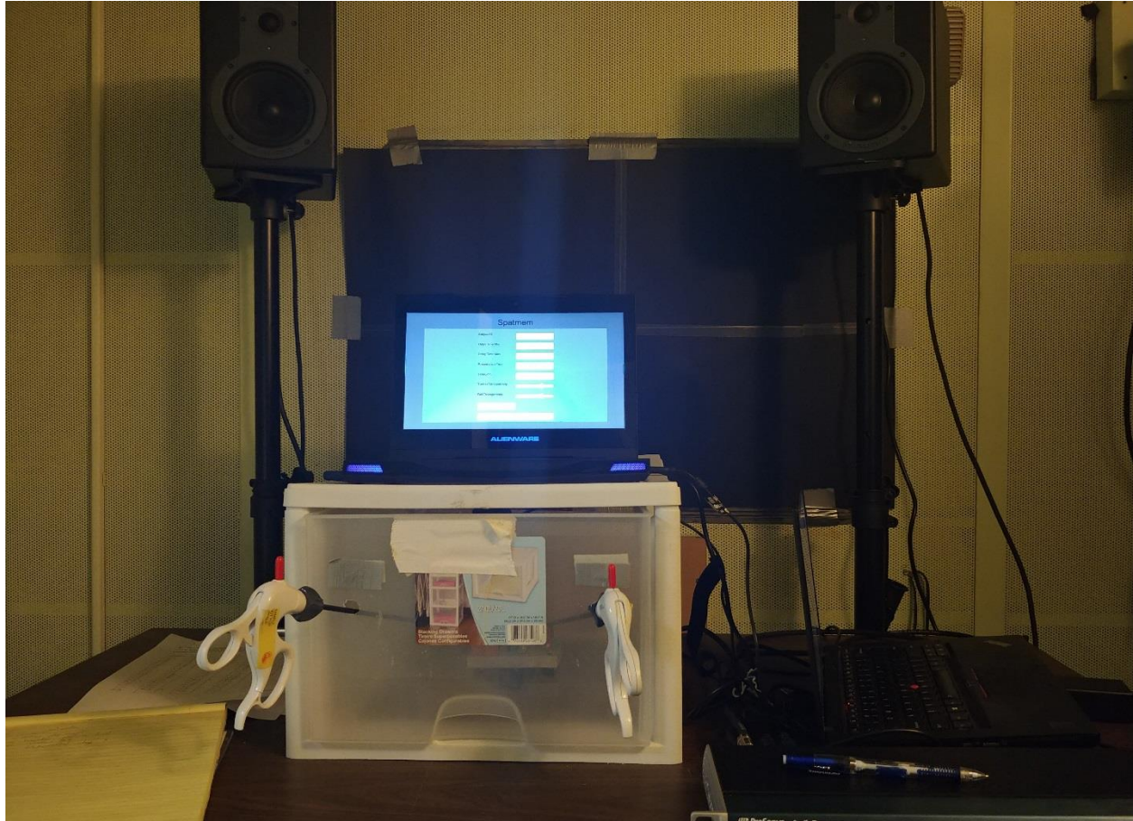
Figure 1. The experimental setup with display.

AW2210 monitor placed on top of the trainer box. The video image and the ball-and-tunnel task (see below Figure 1 below) is presented on the Alienware laptop.